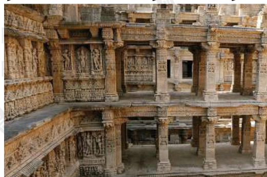
Rani-ki-Vav, an 11th century stepwell in Gujarat's Patan area.